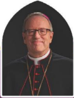
BISHOP ROBERT BARRON