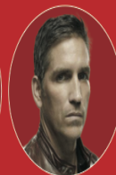
Jim Caviezel ACTOR (Passion of the Christ)