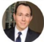
Raymond Arroyo FOX NEWS/ EWTN

There is no better Christmas gift for the men in your life than tickets to this!