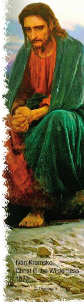
Ivan Kramskoi Christ in the Wilderness 1872

Articles for the bulletin must be submitted in writing to the Parish center or by email to lgibbons@littleflowerparish.org by noon on Monday.