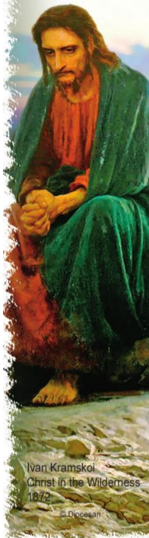
Ivan Kramskoi Christ in the Wilderness 1872

Articles for the bulletin must be submitted in writing to the Parish center or by email to lgibbons@littleflowerparish.org by noon on Monday.