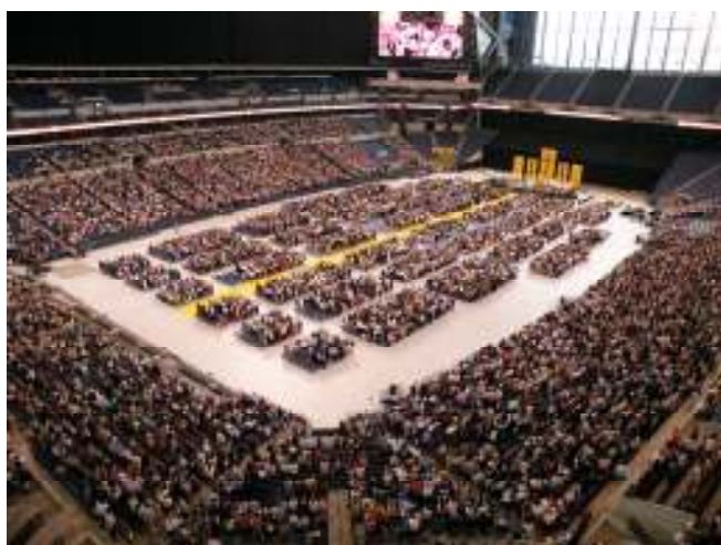
Confirmation at Lucas Oil Stadium

By the time Little Flower students graduate, they have received a well-rounded education. They plan school Mass liturgies, participate in school musicals, take advantage of creative music and art programs, acquire computer skills, contribute to the betterment of their community through many hours of service, participate in science fairs, and travel to Washington, D.C., to study and explore the nation's heritage, museums, and seat of government. Catholic Youth Organization sports, sponsored by the Little Flower Athletic Association, also remain an integral part of the school's mission, although in recent years some programs such as football have been combined with those of other Eastside schools.