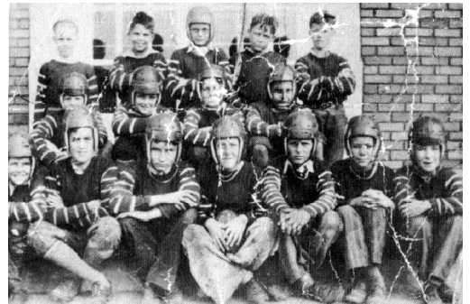
1932-First Championship Team

Those parishioners who still had jobs pitched in to supply meat. No organization like the St. Vincent de Paul Society yet existed to help those experiencing financial hardship.