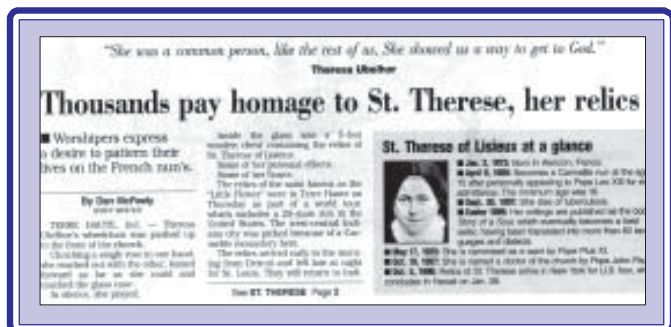
The Indianapolis Star, November 5, 1999

SOURCES: National Shrine of St. Therese, Monastery of St. Therese, "Lives of Saints," Catholic Online, and Apostolic Letter of Pope John Paul II.