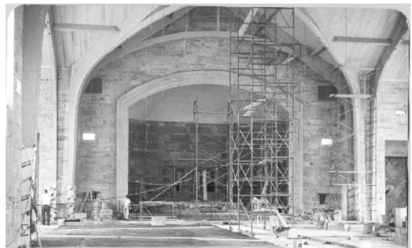
Church's structure takes shape