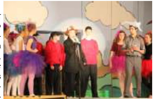
2012 Production -Seussical the Musical

Little Flower also continued to promote widespread participation in school musicals, such as The Music Man Jr. , as well as the school's multimedia arts program. Both programs are considered strong features of the school that enjoy support from the entire parish.