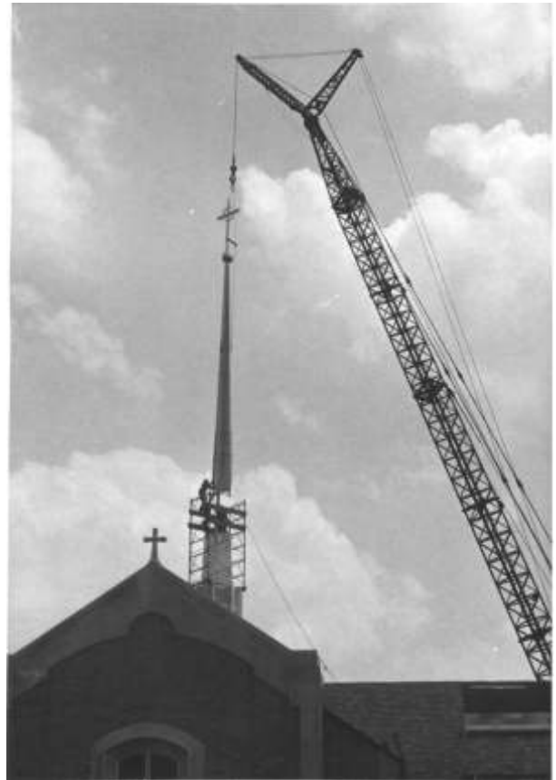
A boom crane positions the steeple