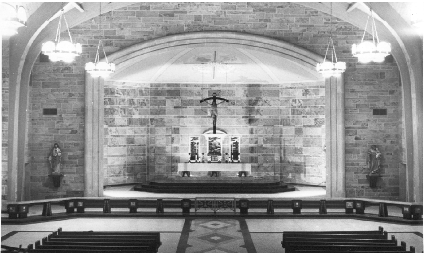
The new church with altar facing away from congregation and communion rail.