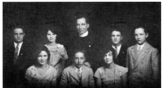
First graduating class in 1927