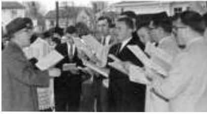
Men's choir at church dedication