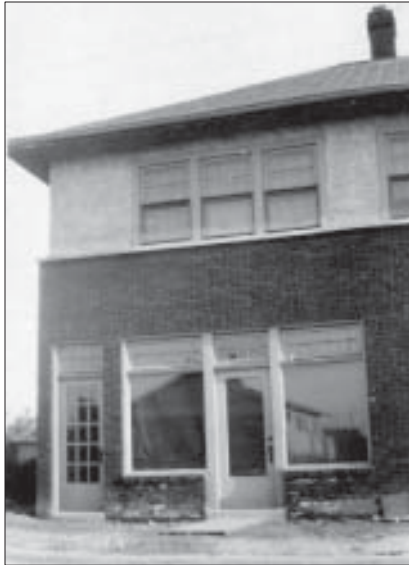
The Phillips Building

Undaunted by this raw hatred and bigotry, Little Flower parishioners, who were mostly of Irish and German descent, went about assembling lay groups that would become the heart of their parish community.