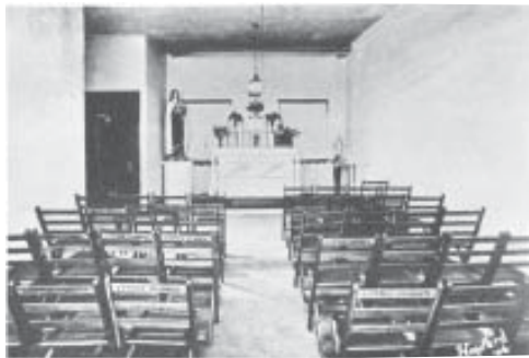
Interior of the first church

The following February, Father Duffey began living in the makeshift church and celebrating Mass daily. A statue of St.