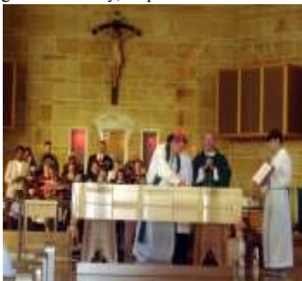
Archbishop Buechlein blesses new altar

The parish, in a sign of vibrancy, experienced a whirl of restoration projects from 2005 on. With a $30,000 grant from the nonprofit Indianapolis Center for Congregations, Little Flower renovated its sanctuary area during 2005-06. The size of the sanctuary was reduced, and it was rebuilt, elevated, and equipped with a ramp allowing older parishioners to continue to serve in liturgical ministries. After the sanctuary renovation, which included new choir seating, contributions from private donors made possible the purchase of new custom altar furnishings from Weberding's Carving Shop in Batesville, Ind., which replicated Little Flower's original high altar.