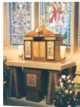
Perpetual Adoration Chapel