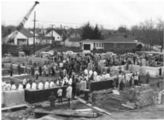
The laying of the cornerstone

When he had arrived in March 1942, the parish was struggling to pay off a $126,000 debt that had mounted after Sunday collections plummeted during the Great Depression.