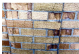
Crumbling brick exterior

During the summer of 2009, the parish restored the Bosart Avenue school entrance and configured a small courtyard at the entrance using alumni contributions and proceeds from the sale of personalized brick pavers. This main entrance, which had been used more when students walked to school, had fallen into disrepair.