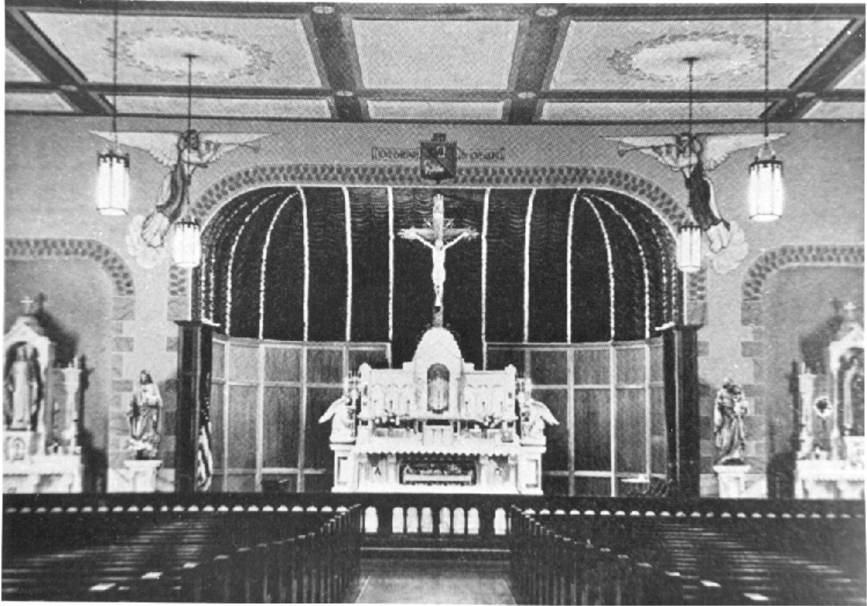
Little Flower Church 1945-1962

The parish's first public Novena to St. Therese came to a close on Sept. 30, 1927, then her feast day, with 1,500 worshipers present. Excitement about her canonization, stoked by her inspirational "little way," moved people to pour into the Eastside