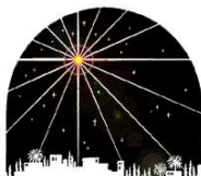
The Road to Christmas

On the weekend of November 19th and 20th as we celebrate the Feast of Christ the King, lectors, servers, music ministers, greeters, ushers, and arts and environment ministers will be commissioned at all Masses. (Because of their special role, Eucharistic ministers will be commissioned next spring at the Holy Thursday liturgy.) Please plan to come forward for a special blessing at whatever Mass you attend.